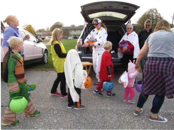
Trunk-or-Treating was BUSY!!