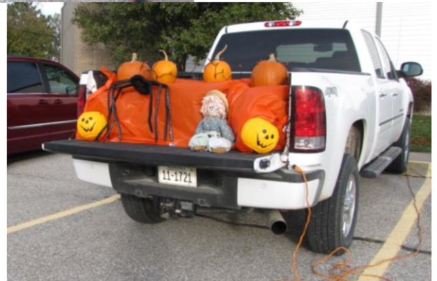
A whole new meaning to "Tail-Gating"!

Psalm 27:1, ESV: The LORD is my light and my salvation; whom shall I fear? The LORD is the stronghold of my life; of whom shall I be afraid?