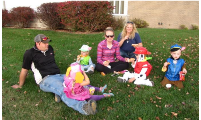
Families enjoying food and fellowship at Trinity!