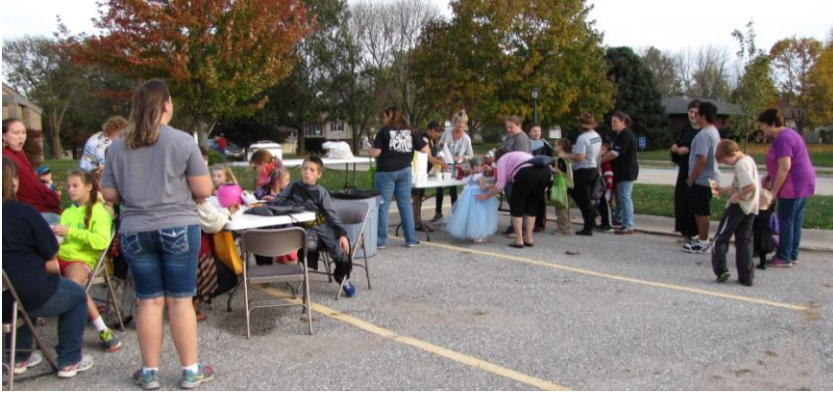
Lots of hungry guests thought those hot dogs smelled good!!