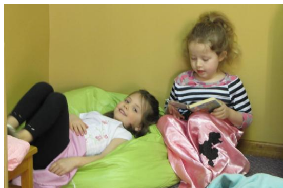
Pajama parties remain a favorite event at Preschool!