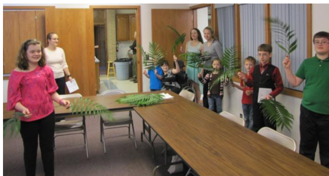
Getting ready to process with palms waving.