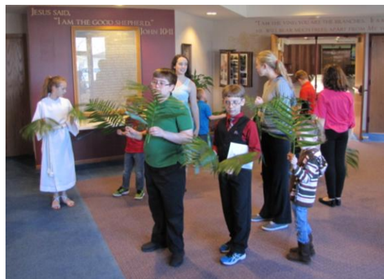
Our Sunday School students about to enter the sanctuary.