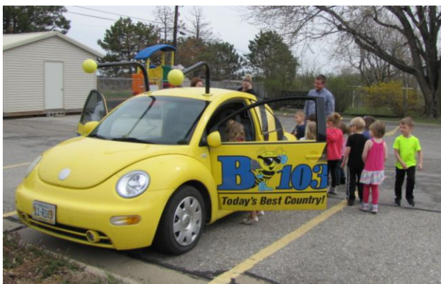
The “Bee Mobile”